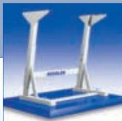
Series KES – for heavy and dynamic sewing machines.