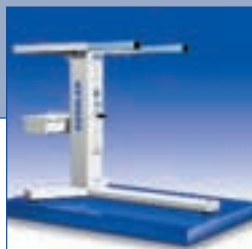
Series KEG – the flexible pedestal stand (height adjustable either electrically or manually).