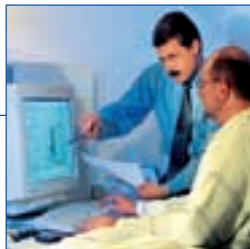
Development and design – where new ideas are born.