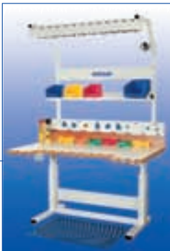
Example: worktable with recessed work surface 1.5 m (59 in.) and energy strip.