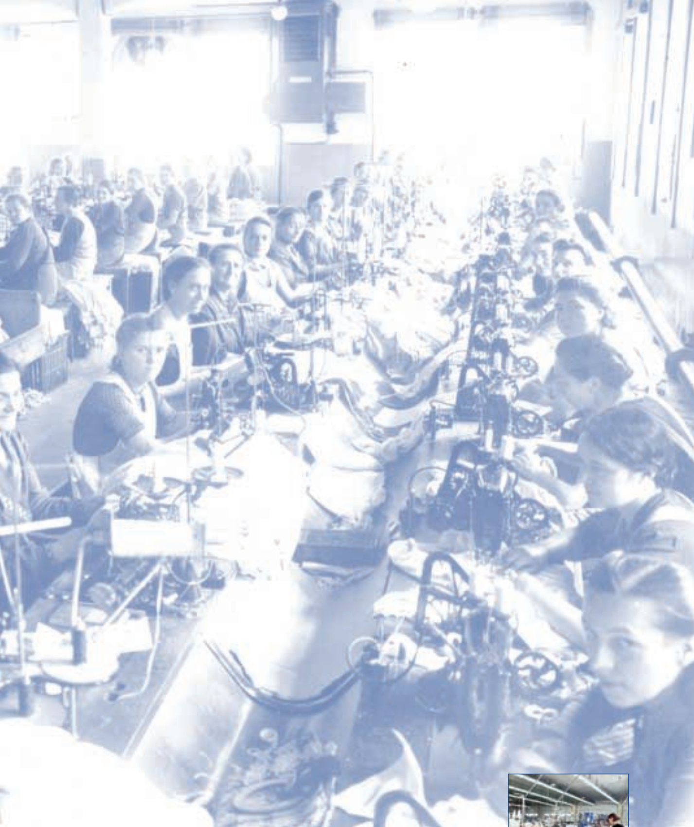
Sewing operations / facility around 1930 – when ergonomics was still in its infancy.