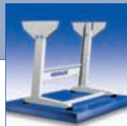
Series KSV – the basic model, proven a hundred thousand times over.