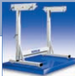
Series KES-2100 – extremely large height adjustment range (by hand crank).