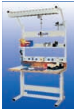
Example: worktable with standard work surface 1.5 m (59 in.) and energy strip.