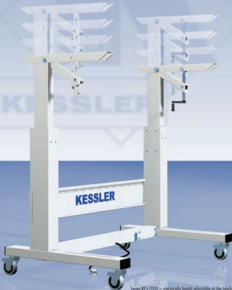
Series KES-2000 – electrically height adjustable at the touch of a button. The ideal workplace for sitting or standing, it has proven its worth thousands of times over.