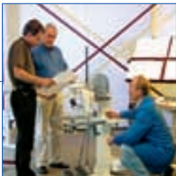
New prototypes for the product series of the future.

A total of five product families, all of modular design, enable hundreds of possible combinations, customized solutions for special task scenarios, and cost-optimized series manufacture of individual components.